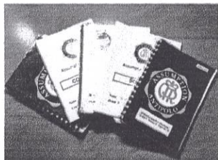
From Old Notebooks

Donate your old notebooks We will refurbish to new ones And donate to our sister schools